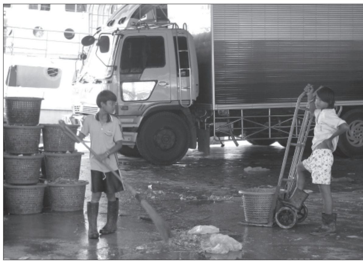
Burmese children laboring in Thailand's seafood industry.